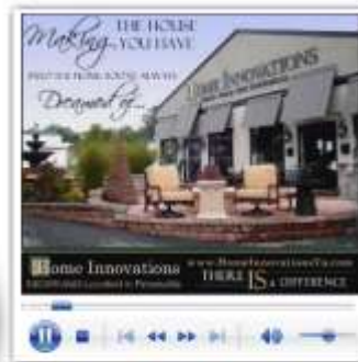
View Example, Click Above