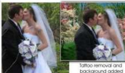
Tattoo removal and background added

pricing may vary based on number of photos and their condition